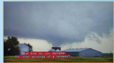
New Enhanced Digital Captions