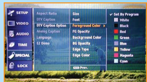
DTV Caption Menu